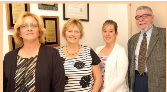
The District's Customer Service staff is available to assist you Monday through Friday, 8 AM to 5:30 PM.