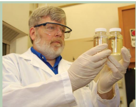
Laboratory staff continually monitor drinking water. Water quality data is posted monthly on the MCWD website ( www.mcwd.org ).

Fort Ord Cleanup Project: fortordcleanup.com