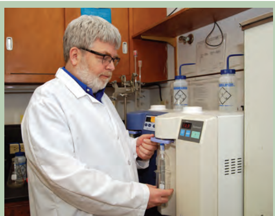
Laboratory staff continually monitor drinking water. Water quality data is posted monthly on the MCWD website ( www.mcwd.org ).

Centers for Disease Control: cdc.gov Fort Ord Cleanup Project: fortordcleanup.com