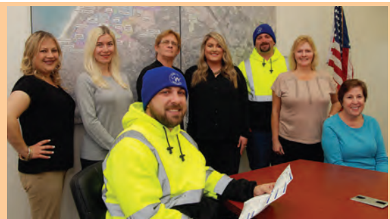
The District's Customer Service staff is available to assist you Monday through Friday, 8 AM to 5:30 PM.